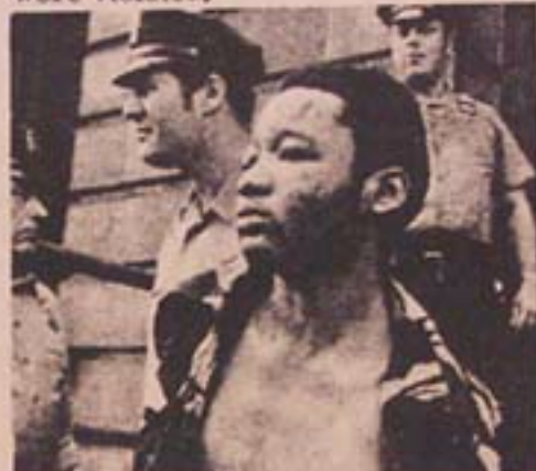
Guards beating prisoners is common in America.