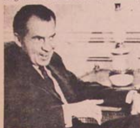
NIXON may lose White House office.

Nixon-supporters have tried to play down the call for impeachment as a mere gesture of protest against Watergate and the secret war, however,