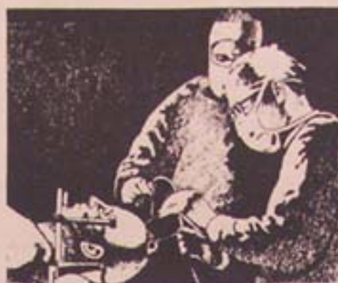
Mind-destroying surgery being performed.