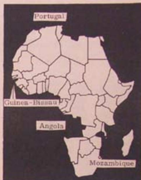
Portugal and the African countries she calls her "Overseas Provinces".

In an interview published recently in the European Business Magazine , Portuguese Prime Minister Marcello Caetano explained why the government takes repressive measures against its citizens. "Liberalization (freedom of speech) has had to be halted in our country", he said. "Its future is seriously threatened by anarchists and by anarchistic socialist ideas."