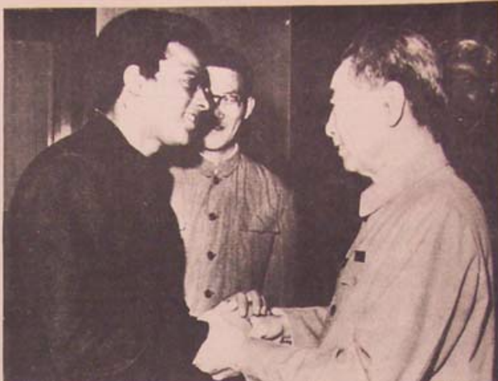
During his trip to China BROTHER HUEY met with Chinese Premier CHOU EN-LAI. They discussed world affairs and oppressed people; Black people in particular.

We also visited as many embassies as possible. Sightseeing took second place to Black Panther business and our desire to talk with revolutionary