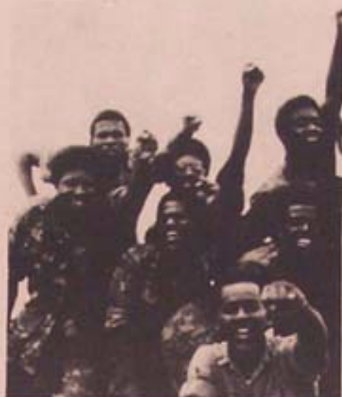
Black Marines are writing against Marine Corp racism.

The ten brothers if convicted face maximum sentences each of six months imprisonment, six months forfeiture of pay and a bad conduct discharge.