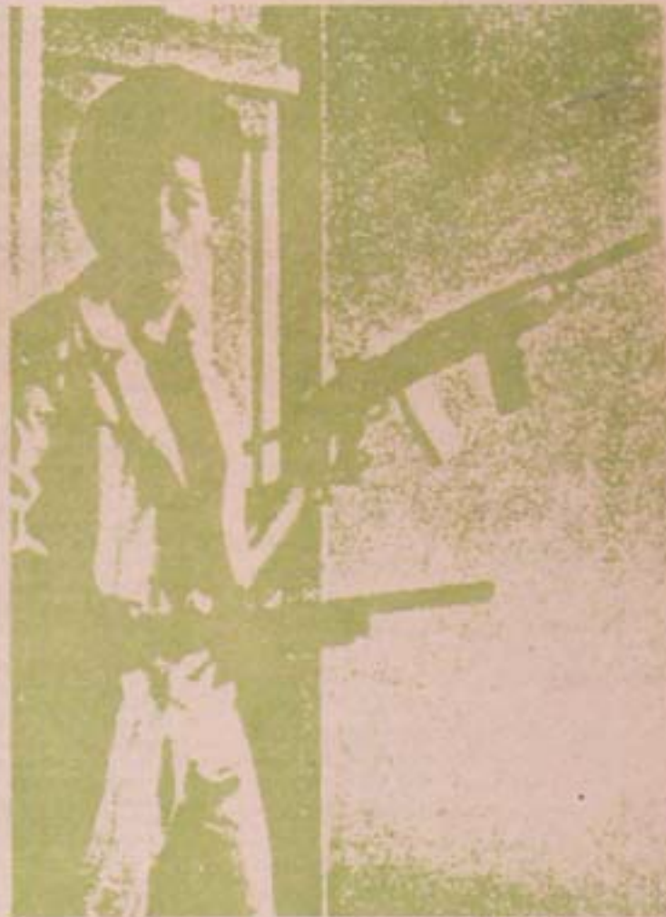
JONATHAN JACKSON, 1970 SEE STORY PAGE 3