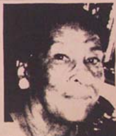
MRS. AMY JACQUES GARVEY