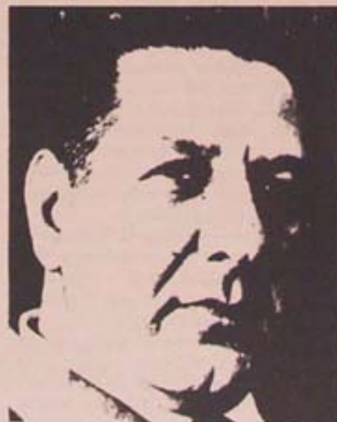
Ex-cep Mayor RIZZO: For every one of us, we'll take two of them.

Established allegedly to reduce crime in high crime areas, ACT presently functions in the Black communities of West, North and North Central Philadelphia. Like STRESS, ACT's 175 specially trained agents dress causally or pose as drunks, drug addicts, truck drivers, college students or insurance salesmen in order to blend into the background. All agents are equipped with bugging devices.