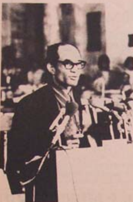
Wisconsin state assemblyman, LLOYD BARBEE, urges the U.S. government to aid drought-stricken West Africa.

Wisconsin state legislator Lloyd Barbee, a proud and astute Black commentator, once again presents a clear analysis: the plight of six drought stricken West African nations and our responsibility.