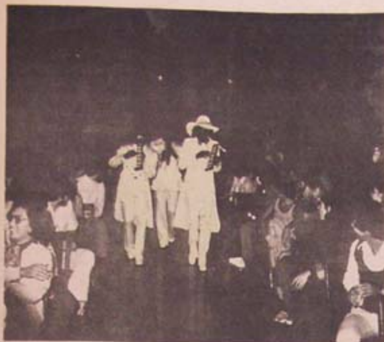
By the time GRAHAM CENTRAL STATION reached the stage, they had Oakland Auditorium rocking.