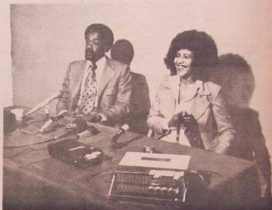
BOBBY SEALE and ELAINE BROWN at press conference announcing Black Panther Party suit against Ike and Tina Turner Productions, Inc.

All weekend long, the media had a field day. "Panthers, Show Folk, In Scuffle", read a front page headline in the Oakland Tribune . KDIA, the Black "soul" station, broadcast the police report of the "incident" early the following morning. Their news reports throughout the day stressed Ike Turner's head lacerations. "Panthers Deny Beating Ike Turner", screamed the scandal-filled Sun Reporter . The small caption, beneath a picture of Tina Turner in the middle of one of her "numbers", missed none of the melodrama: "Tina's man still screams".